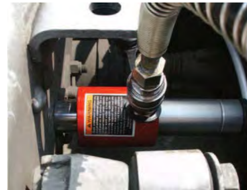
▲ Press truck wheel from nave with the mini-press. Fits between the chassis and wheel.